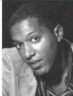
From left: Lemn Sissay, Benjamin Zephaniah