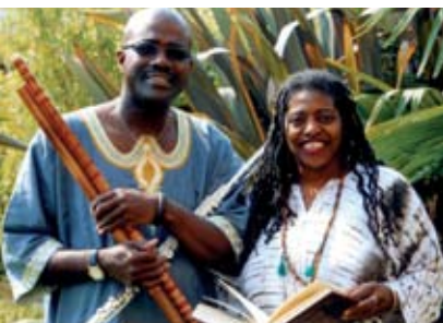
From top: Africa China launch event, Treasures of the Rainforest

Young Face of Africa Dance Group - 5-14 year old dancers adorned in beautiful coloured Zulu/Ndebele costumes, Urban Spirit Performance Poet, Beyonder Performance Poet - uses literature as his 'canvas' and digital arts as his 'paintbrush' to bring his words alive, Africa China - uses the Ajegunle sound, mixing reggae and dancehall with local African rhythms.