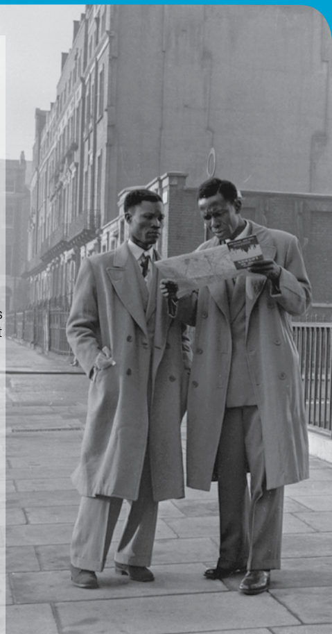
The Ones We Left Behind

Lorna Holder's book, The Ones We Left Behind will be launched at Swiss Cottage Library at 7.30pm on 25 October. See page 11 for details.